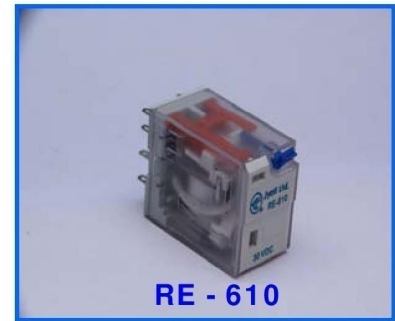
RE - 610

Note: Any coil Voltage can also be supplied against specific requirement.